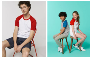
Catcher Short Sleeve Mini Catcher Short Sleeve