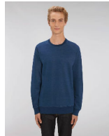
Stanley Stroller Denim