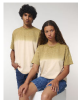
Fuser Aged Dip Dye

Shell : French Terry , 100% Cotton - Organic Ring Spun Combed , Garment washed , Garment dyed , 350 GSM