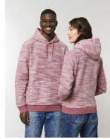
Cruiser Space Dye