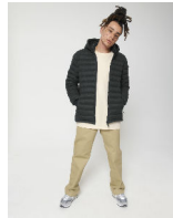
Stanley Voyager Wool-Like

Shell : Plain Weave Brushed , 100% Polyester - Recycled , Fluorine-free DWR , 140 GSM