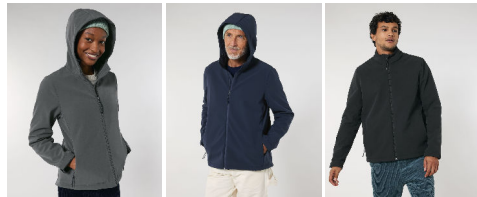
Stella Discoverer Stanley Discoverer Stanley Navigator

Shell : Balanced Plain weave , 6% Elastane , 94% Polyester - Recycled , Fluorine-free DWR , 342 GSM