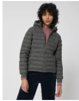
Stella Voyager Wool-Like

Shell : Plain Weave Brushed , 100% Polyester - Recycled , Fluorine-free DWR , 140 GSM