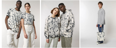
Creator Tie and Dye