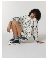
Stella Kicker Tie and Dye