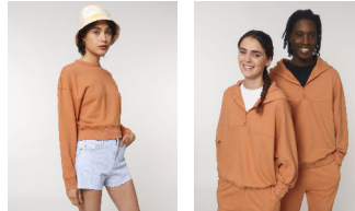
Stella Cropster Wave Terry Globetrotter Wave Terry

Shell : Seersucker Terry , 100% Cotton - Organic Ring Spun Combed , Panel washed , 350 GSM