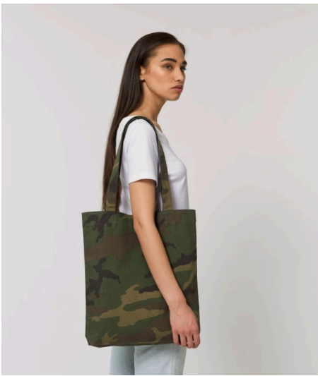
ALL OVER PRINT